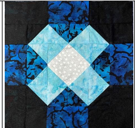
Block size: 12 1/2 inches unfinished