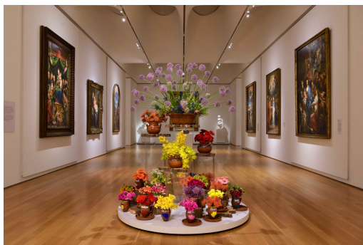
NC Museum of Art, Art in Bloom

The quilts should be 96" or smaller in perimeter and should be bound with black or gold fabric provided by the Guild. The quilt will be hung at the show and should have a sleeve on the back.