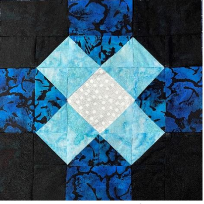
Block size: 12 1/2 inches unfinished