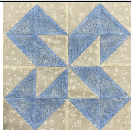
Square is 12 ½ inches unfinished

Be sure to trim the squares in Photo 4 to 3 ½ inches as needed.