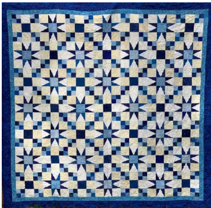
Indigo Dreams, 97"x97"