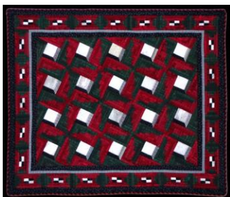
Cabins in the Snow