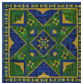
Center Star Expo