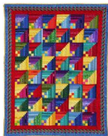
Offset Four Patch in Color